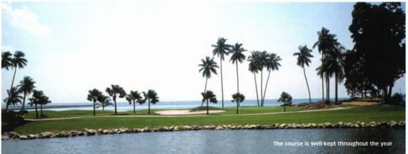
The course is well-kept throughout the year

It is a mean dogleg right par-5 stretching 529 metres that has water run all the way